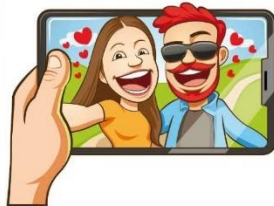
A Parent's Guide to Sharing Pictures