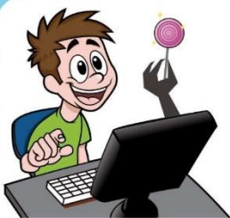
A Parent's Guide to Online Grooming