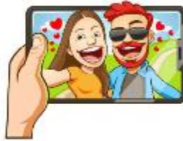
A Parent's Guide to Sharing Pictures