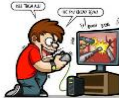
A Parent's Guide to Gaming