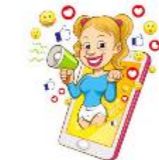
A Parent's Guide to Online Influencers