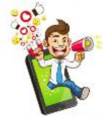
A Parent's Guide to Live Streaming