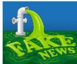
A Parent's Guide to Fake News